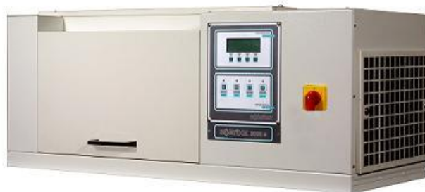
SOLARBOX 3000 E

Consequently, because the temperature produces an accelerated ageing, it is essential to be able to control of B.S.T. during exposure to filtered Xenon radiation.