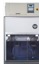
SOLARBOX R.H. with Humidity Control

We reserve the right to make changes to equipment and systems in response to advances in technology and modify parameter values accordingly.