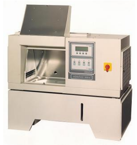
SOLARBOX 1500 E with FLOODING

PVC and corrosion-resistant materials ensure long life of this tank pump system: capacity up to 50 litres.