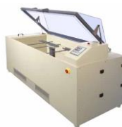
Horizontal Salt spray chambers.