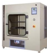
Vertical Salt spray chambers.