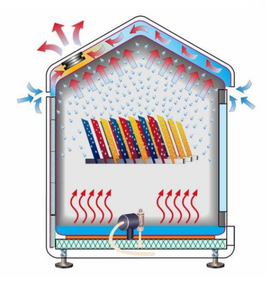
Patented Controlled Water Condensation (CWC) system