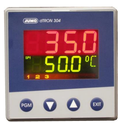
Jumo dTRON controller