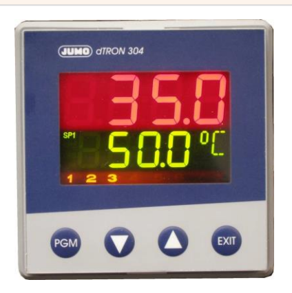
JUMO dTRON controller