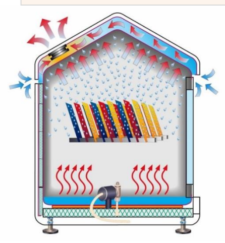
Patented Controlled Water Condensation (CWC) system

- High temperature option HT (max temp 80°C)