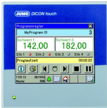
Figure 1 Jumo Dicon touch controller