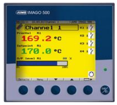
Figure 1 Jumo Imago 500 controller