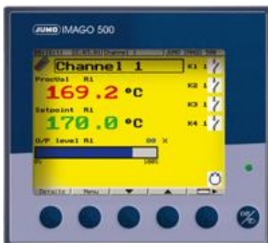
Figure 2 Jumo Imago 500